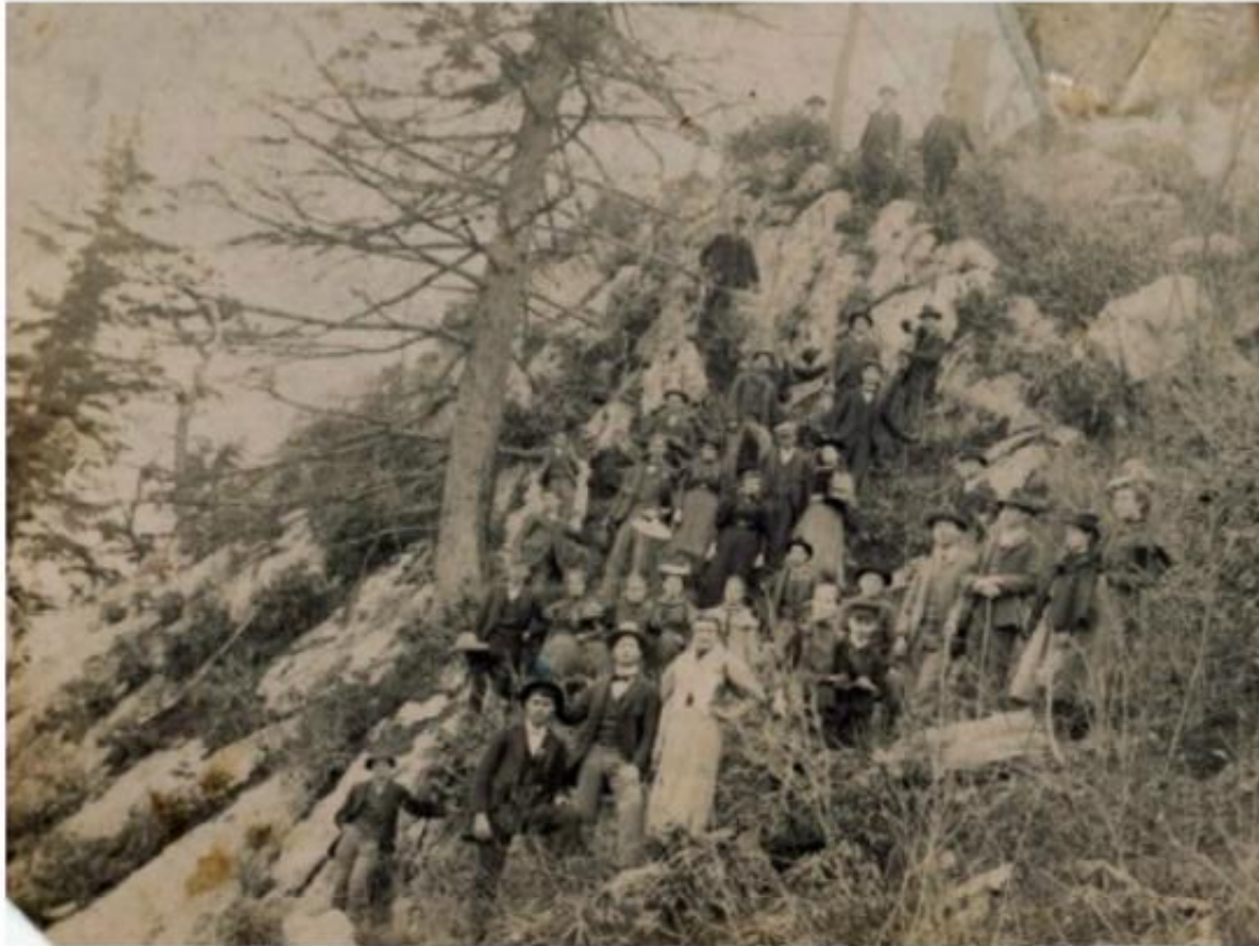
Young people, in their Sunday best, climbing Briar Patch about 1900.