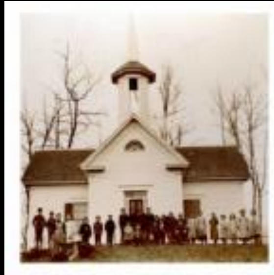
March, 2012 Revised 2018