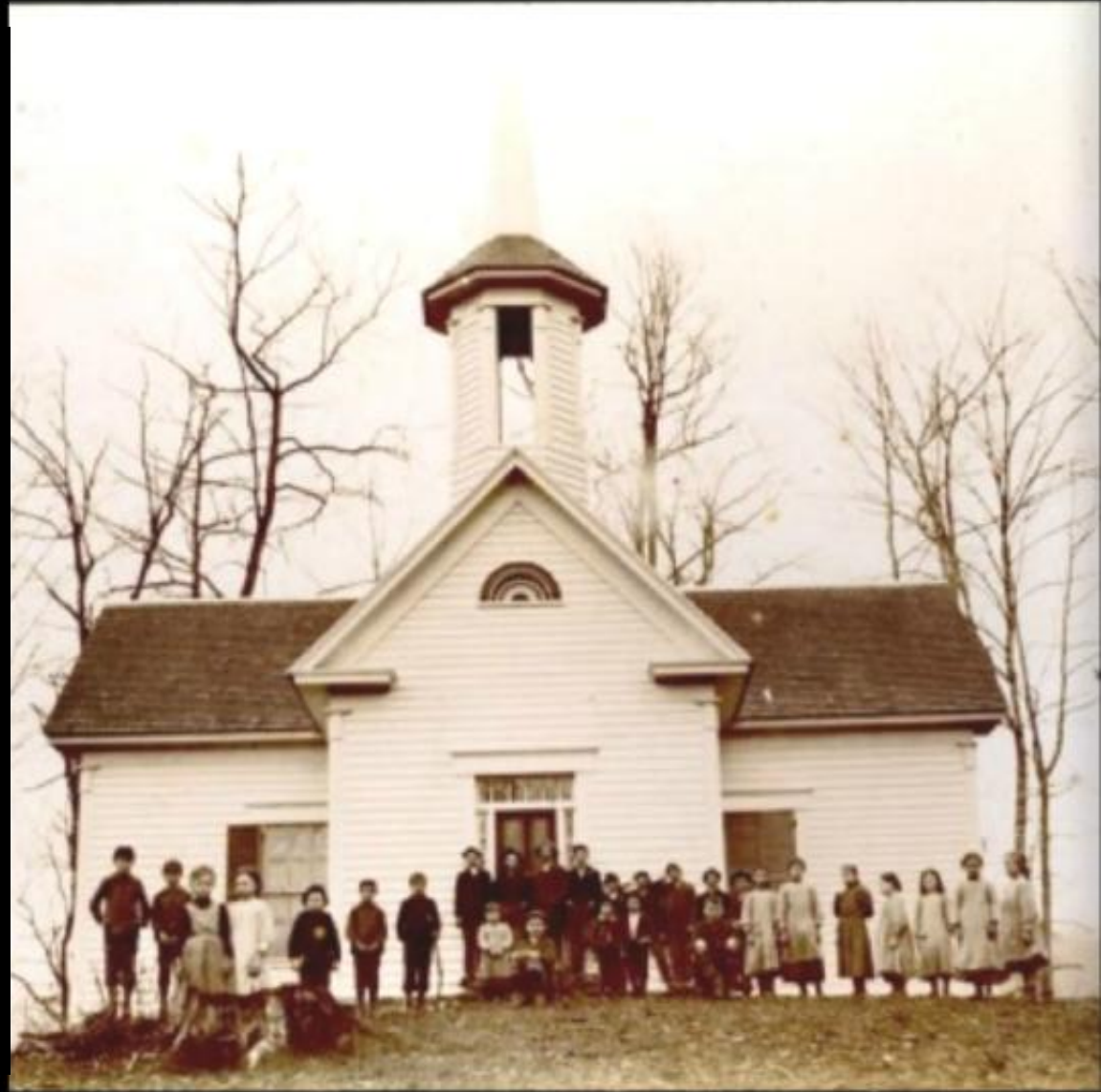
Fallville School about 1895